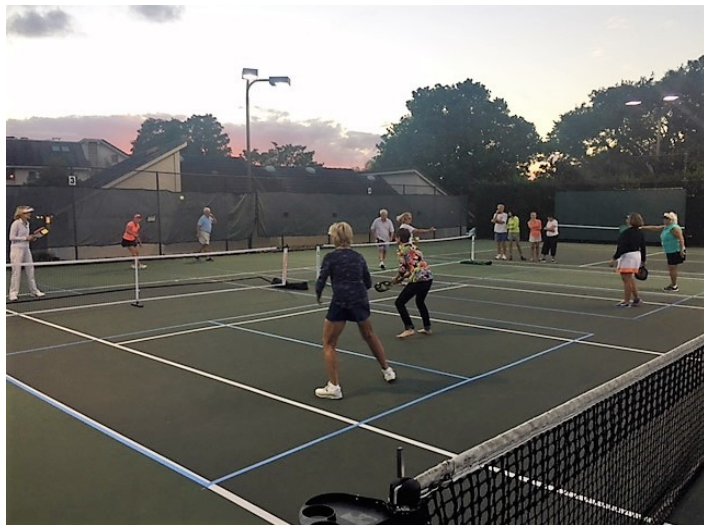
Pickleball In Action!

If you are going to be traveling for the holidays, please be safe and enjoy your time with your friends and family.