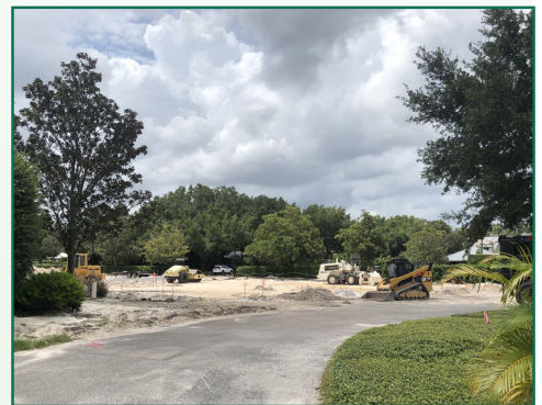
Work progressing in the parking lot nearest the front entrance and porte-cochère