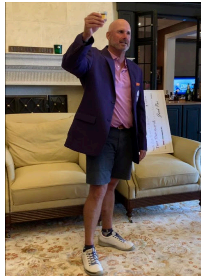
2021 PhedExCup Champ raises a toast inside Bucklers Cabin

Once again, the PhedExCup would like to thank the entire Bay Hill staff and especially the Sunday team for helping to make the third season of the PhedExCup a huge success.