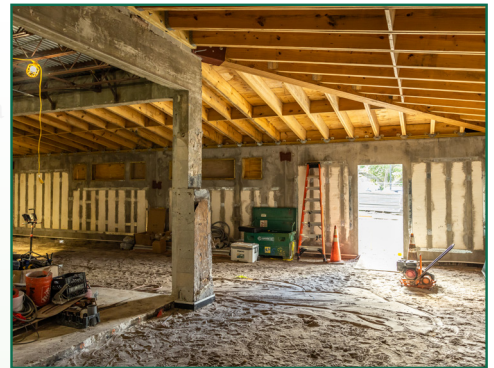
Men's Locker Room Interior