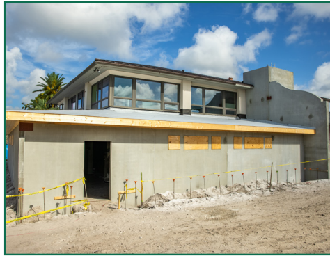
Men's Locker Room Exterior