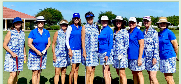
Bay Hill 2020-21 Challenge Cup Team Final Match Players