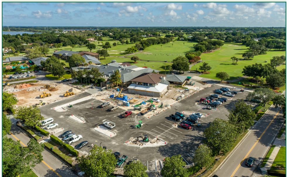
In this aerial view of the parking lot, the new traffic pattern and parking space layout begins to emerge, as well as the addition of a new delivery entrance from Bay Hill Blvd. and islands throughout. Trees and new lighting will soon begin to be installed in the islands, greatly enhancing the overall look and feel of the space.