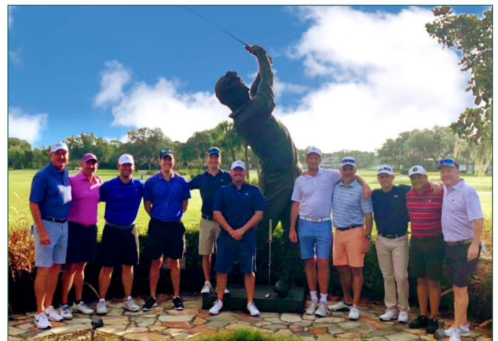
2021 Playoff Contenders