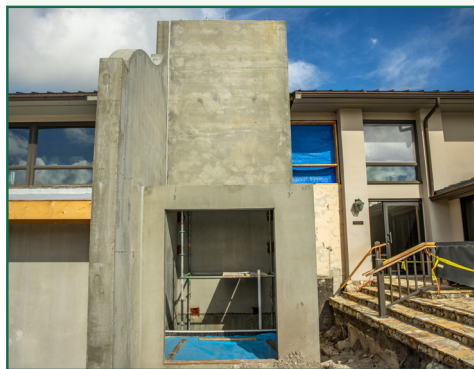
The building will now feature an elevator to the second floor offices