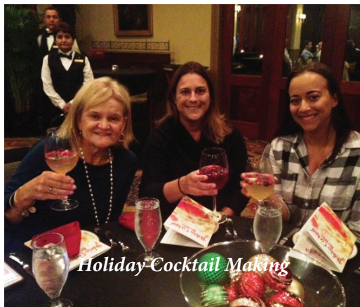
Holiday Cocktail Making