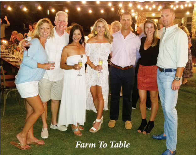
Farm To Table