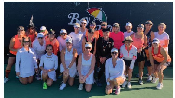
Thanks to everyone that played in the Halloween Social

Paddle up for weekly pickleball! Every Thursday, with the exception of December 27th, there will be adult pickleball round robins. All you need is a partner and a ride to the tennis courts. All equipment will be provided, but you are more than welcome to bring your own paddle and balls. Please sign up on Foretees to register yourself and your partner. Play will begin at 6:30pm.