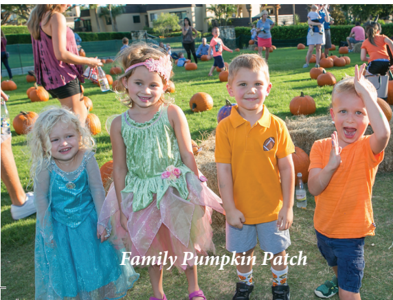
Family Pumpkin Patch