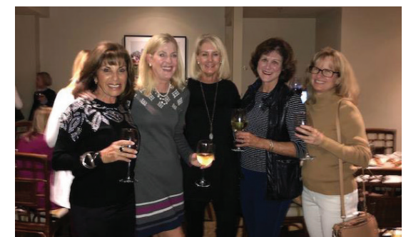
Tennis Happy Hour