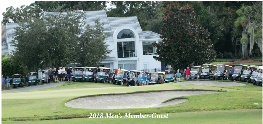
2018 Men's Member-Guest