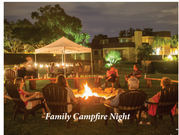
Family Campfire Night