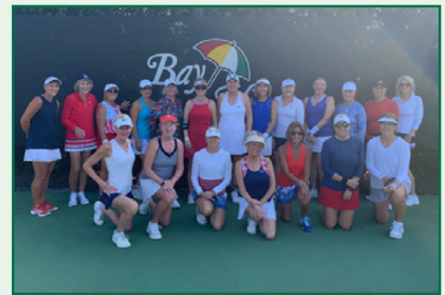
4th of July Round Robin