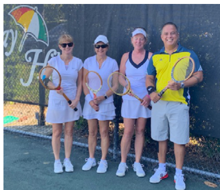
Throw back with the wooden rackets