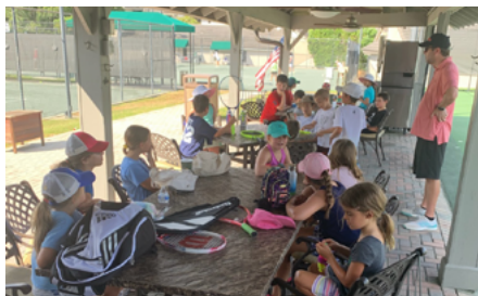
Taking time to relax in the shade