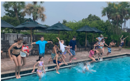
Cooling off after a hot day on the courts

What an incredible summer it has been! Thanks to everyone for coming out and playing in the 4th of July and Wimbledon Socials, participating in the “Chalk Talks”, enjoying some free time during Kid’s Night Out, and of course, we have had an absolute blast with the Junior Summer Camps.