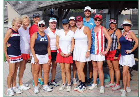
July 4th Social