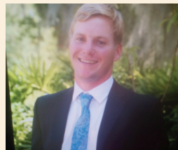
Blake Hutton Legacy Junior Golf