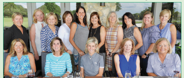
Challenge Cup Champions celebrate win