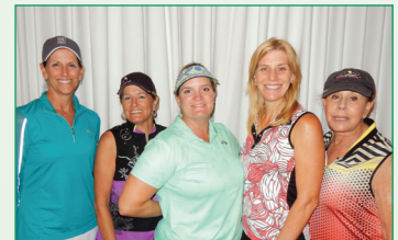
Year End Ringer Flight Winners