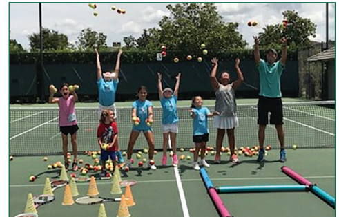
June Kids Camp