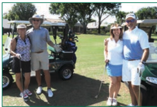
May Sun. Scramble Flt 2 Winners

We are looking forward to another fantastic season of golf!