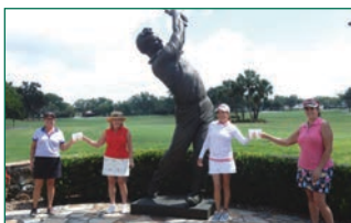
Year End Scramble Winners